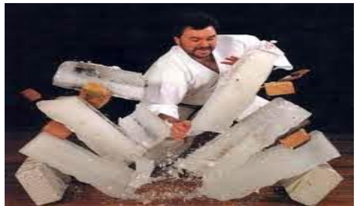
Icebreaker – The first maiden speech in which one day you will look back and say to yourself "Wow, I have improved this much!"

Remember, above all, take on the stage with zest and start drooling oops, I mean sharing. Breaking or melting the ice? It is entirely your choice and what better way to do it than in toastmasters where we can make mistake, have fun and continue to be better. So if you have not started your project speech 1 on ice breaker, ask yourself WHY?