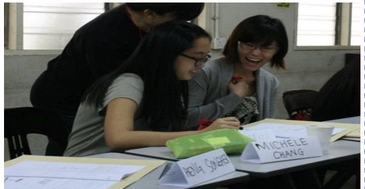
I just love to make everyone else around me laugh!

Who knows? Toastmasters might just be your road to greatness!